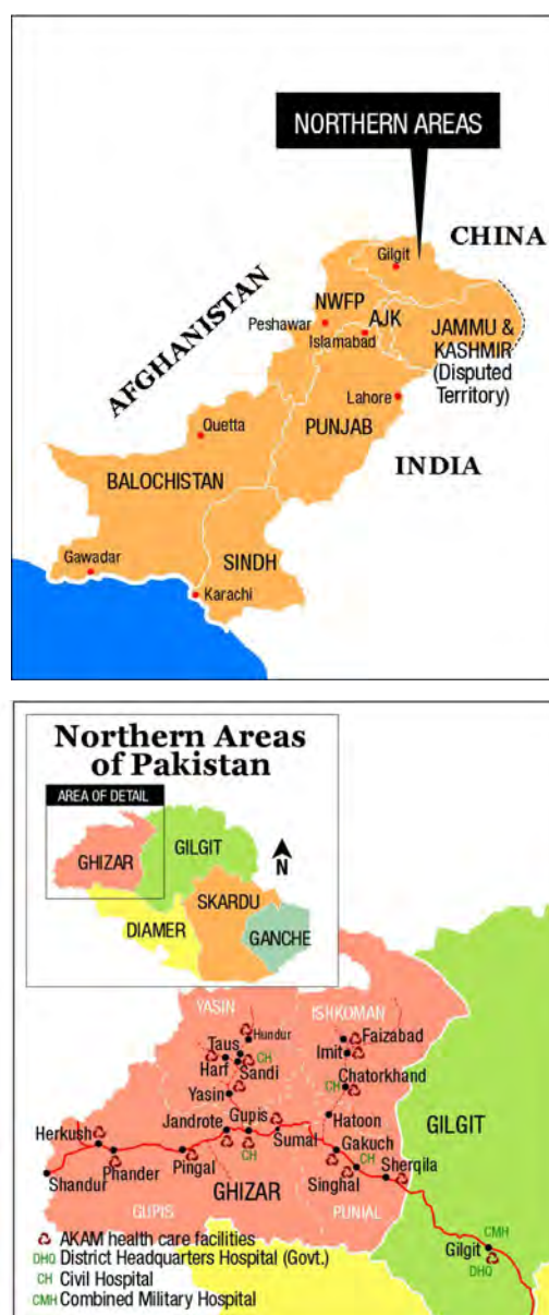
FIGURE 2 - MAPS OF PAKISTAN WITH NORTHERN AREAS HIGHLIGHTED AND THE GHIZAR DISTRICT WITH NORTHERN AREAS INSET

—FROM THE ASSESSMENT OF HEALTH MICROINSURANCE OUTCOMES IN NORTHERN AREAS, PAKISTAN - BASELINE REPORT